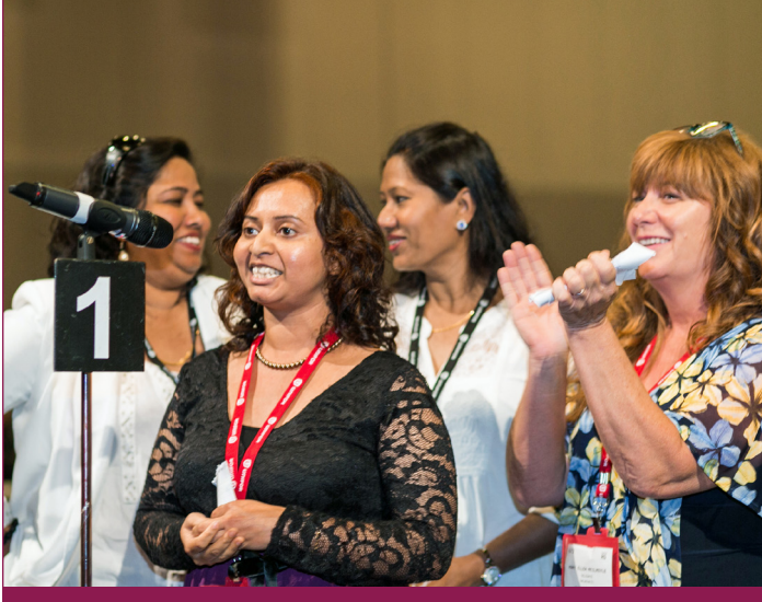
Members of the East Danforth Community Chapter attended their first convention in Ottawa in August.

Many spoke of the difficulties they have encountered as immigrants