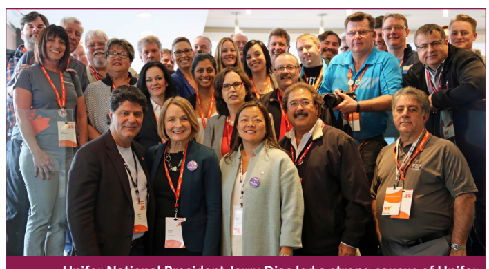
Unifor National President Jerry Dias led a strong caucus of Unifor activists to the NDP national convention in Edmonton recently.

A key focus of policy debate was climate change. An amended resolution requires meaningful consultation and dialogue before the party adopts climate change policy