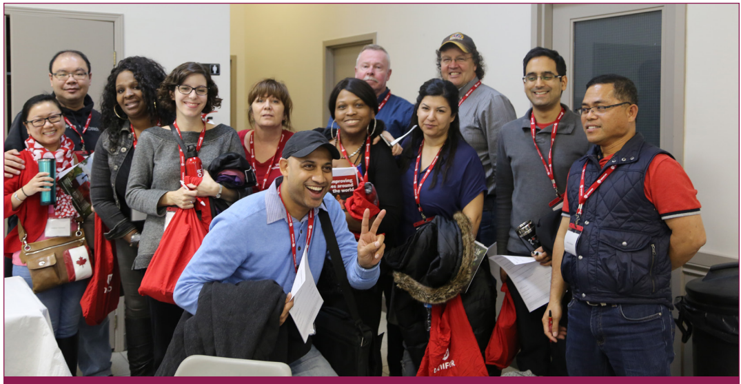
Unifor staff and members from across every sector have answered the union's call to help Syrian refugees settle in Canada, and have been attending training sessions to help them do that. Story Page 2.