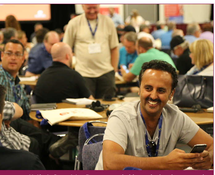
Unifor's Organizing Department held a packed and very popular Organizing Summit in 2015 as part of its efforts to boost membership .

For more, go to unifor. org/stelpipewelland.