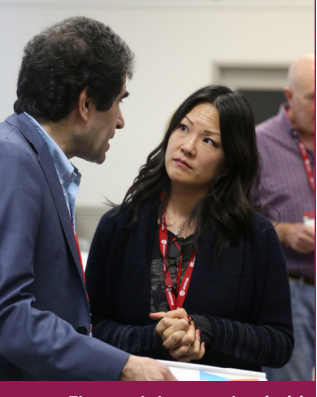
First training session held before Christmas.

Financial sponsorship was made possible through