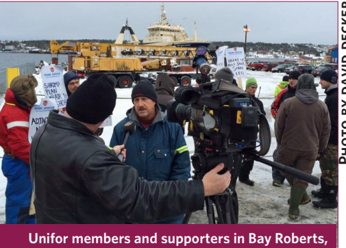
Unifor members and supporters in Bay Roberts, Newfoundland, rallied January 23 against Northern Shrimp quota cuts